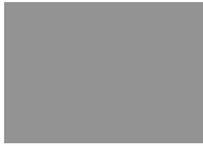
U18 Gull Gray