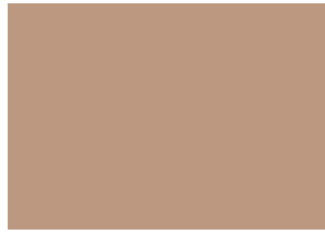
U12 Sunset Beige