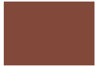
U34 Brick Red