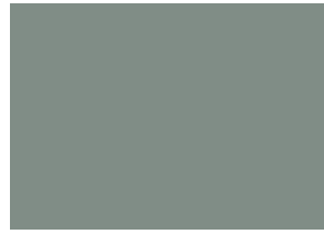
U35 Shadow Slate