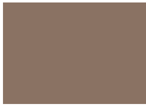
U27 Mocha Brown