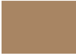
U10 Sonoran Tan

Colors shown on this chart approximate the color of broom finished concrete flatwork made with a medium gray cement and cured with SikaColor™-500 Colorwax™ in the matching color or sealed with SikaCem®-100 Clear Guard®. If SikaColor™-500 Colorwax™ or SikaCem®-100 Clear Guard® are not used, the concrete color will not be as vibrant as shown. Concrete should be batched and placed in accordance with Product Data Sheets. Concrete color is altered by many factors, including cement and aggregate color, slump, finishing practices, and curing method. Using the contemplated materials and construction techniques, representative samples should be cast for approval, especially when exact color matching is important.