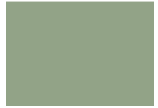
U51 Clary Sage